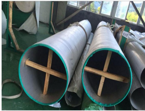
2 nd Step