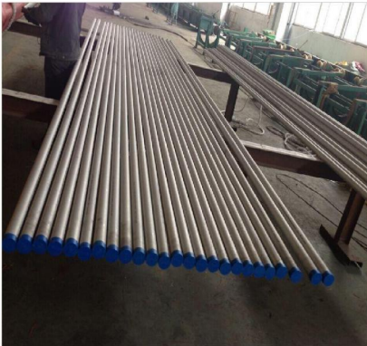
1 st Step