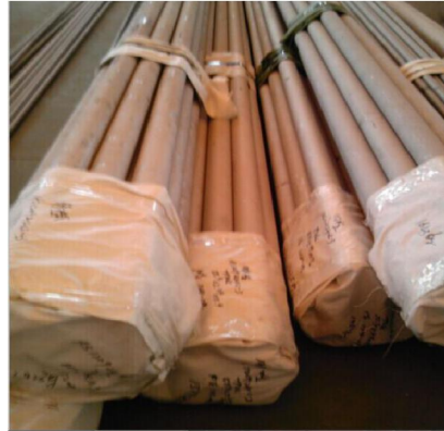
2 nd Step