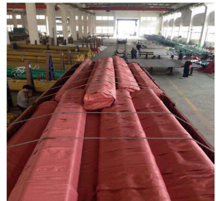
3 rd Step (with Nylon Strip)